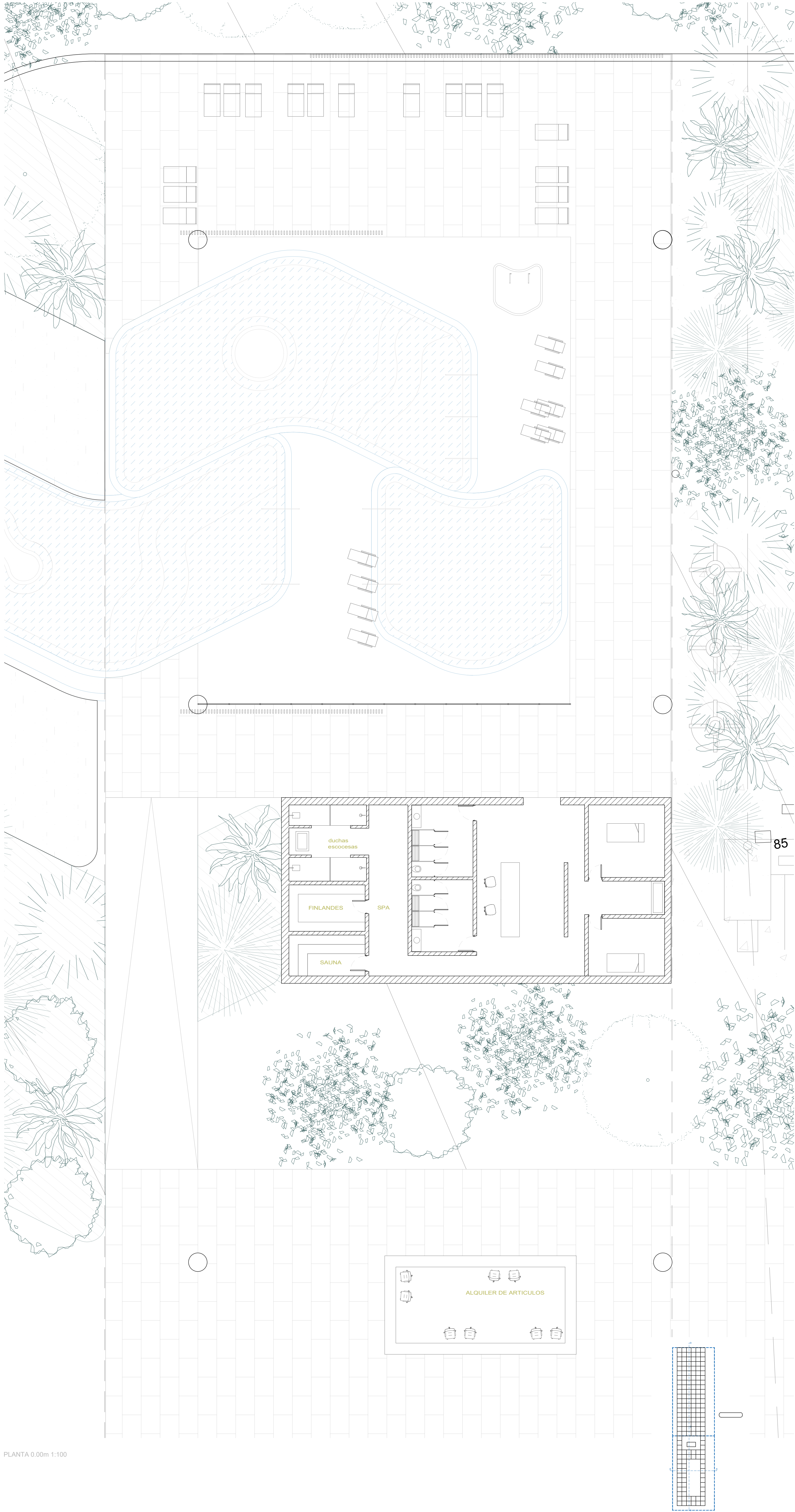
PLANTA 0.00m 1:100