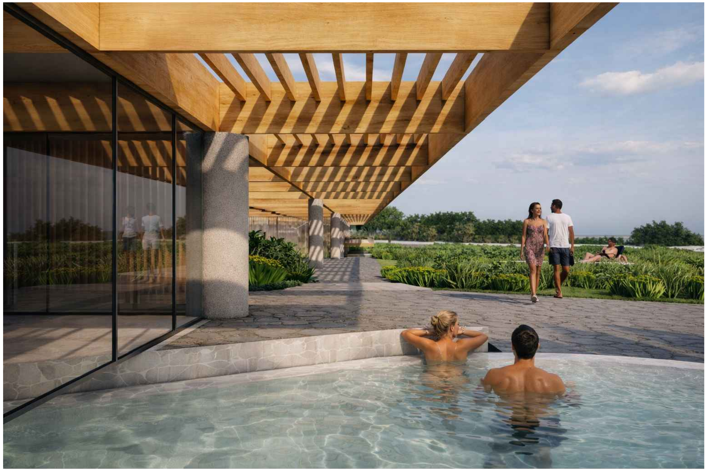
RENDER EXTERIOR AREA DE RELAJACION