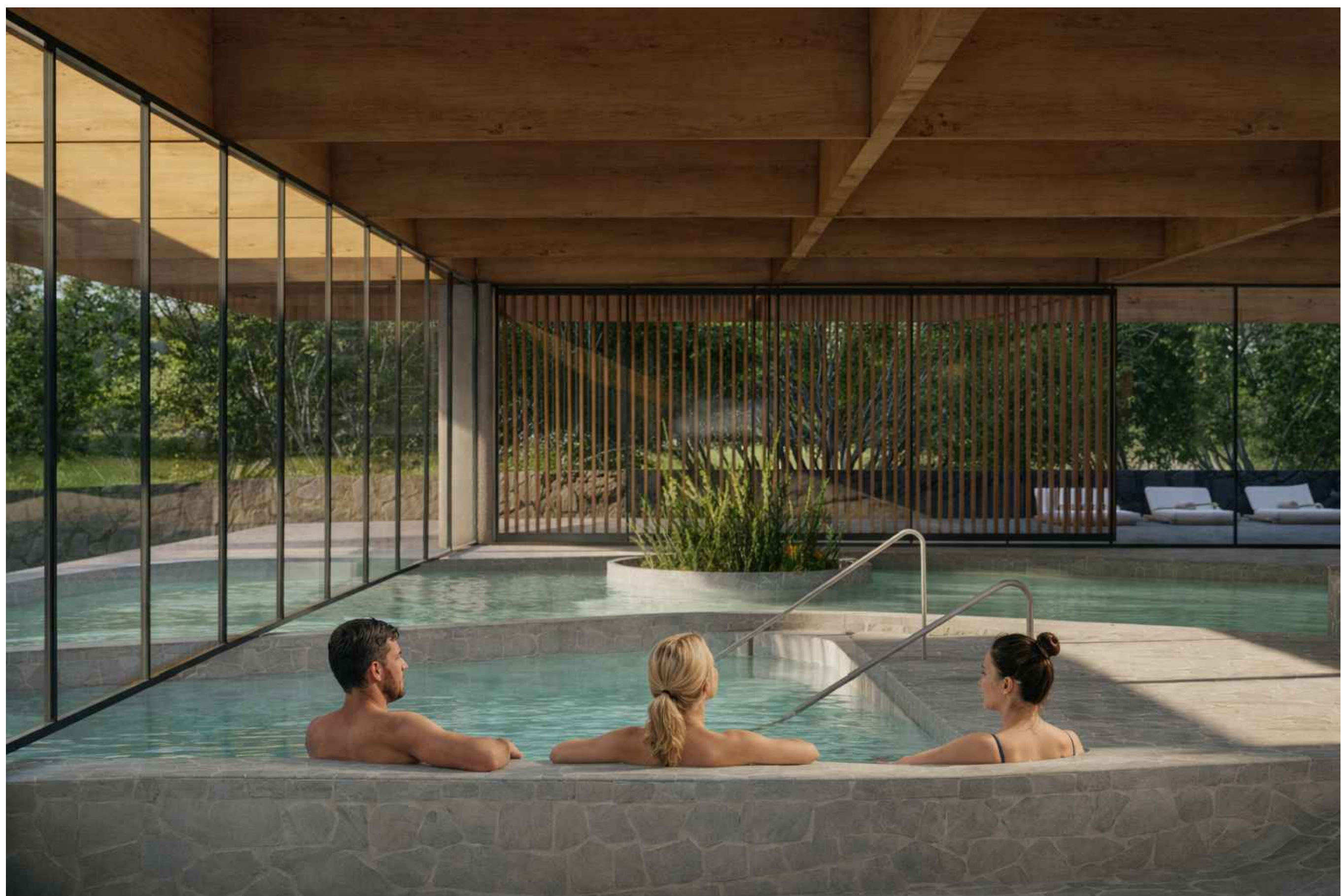
RENDER INTERIOR DE AREA DE RELAJACION