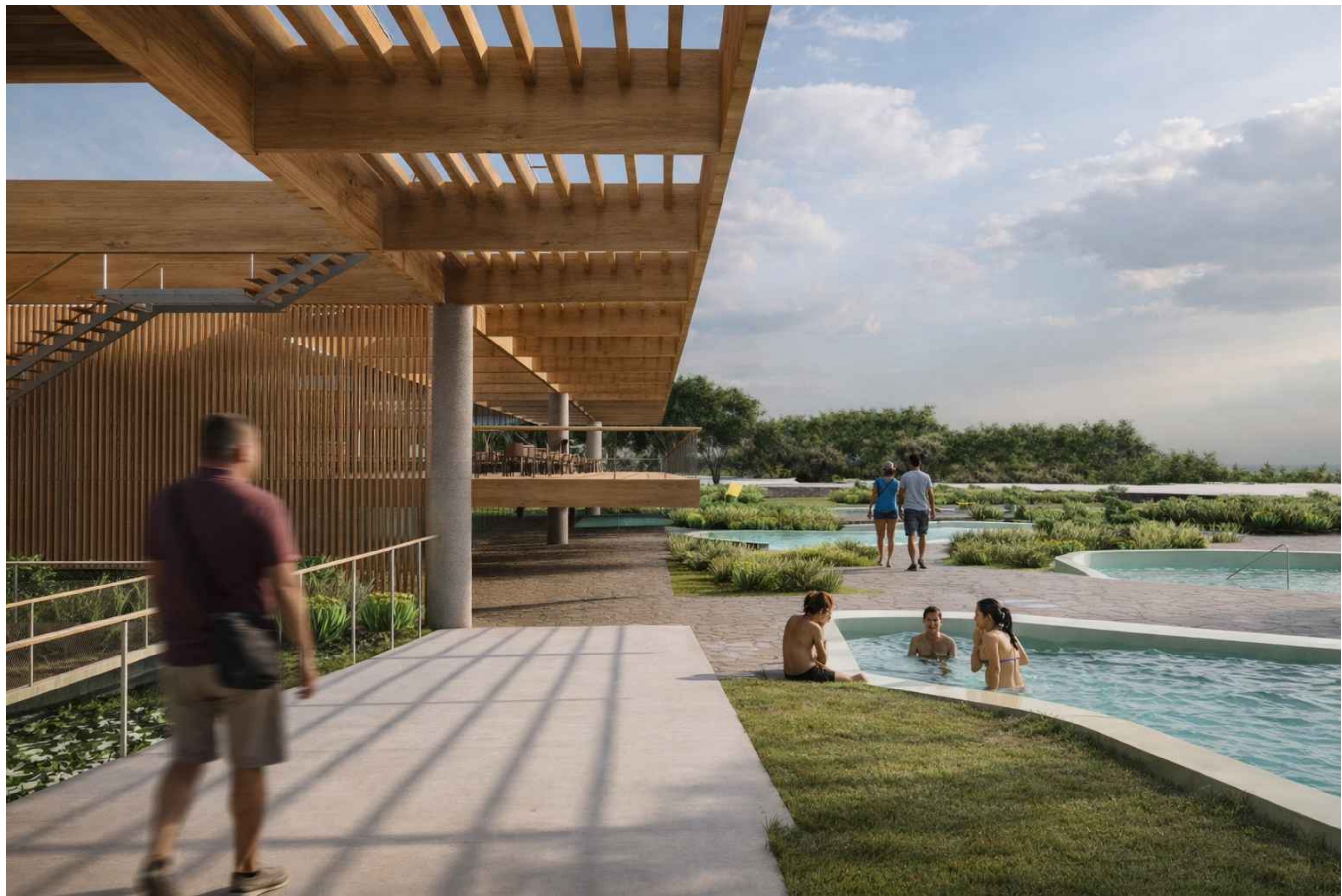
RENDER EXTERIOR CIRCULACION PERIMETRAL